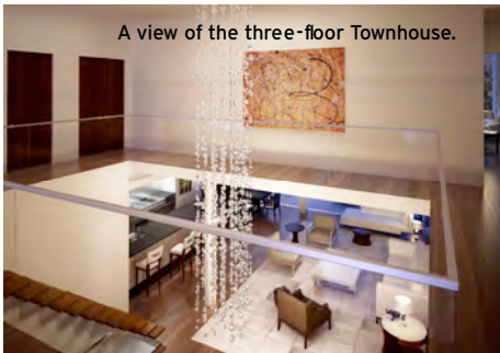
A view of the three-floor Townhouse.