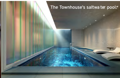
The Townhouse’s saltwater pool.