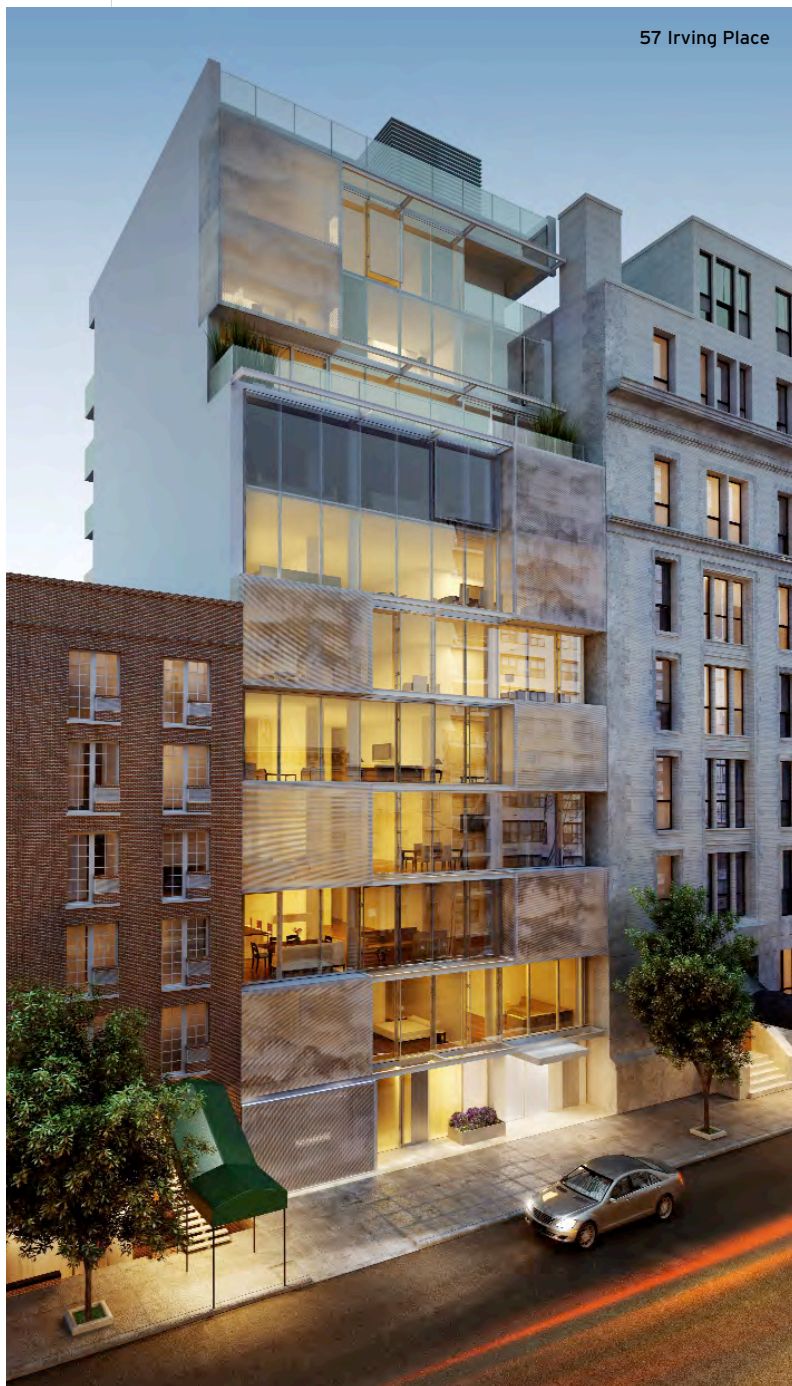
57 Irving Place