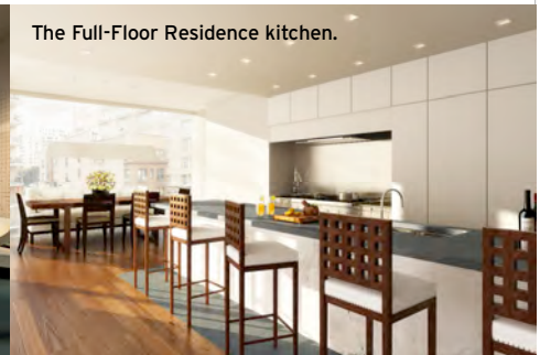
The Full-Floor Residence kitchen.